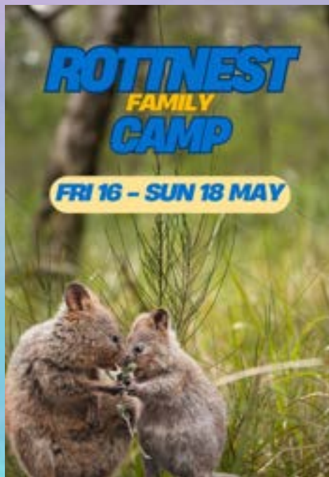
ROTTNEST FAMILY CAMP Friday 16 - Sunday 18 May FIND FERRY DISCOUNT CODES HERE