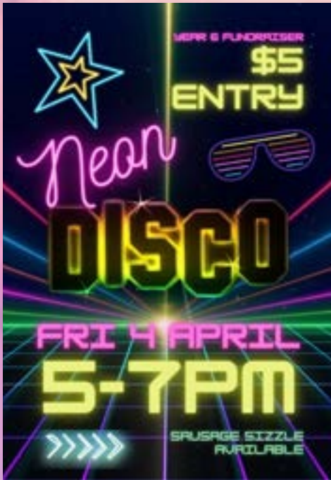
TERM 1 DISCO Friday 4 April