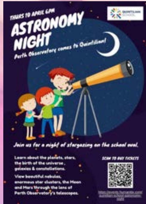
ASTRONOMY NIGHT Thursday 10 April BUY TICKETS HERE