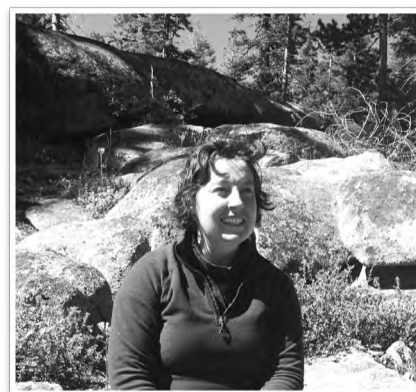
Some days my work involves wading through a pristine river, camping in the mountains or spending a day in a vineyard in the Napa Valley as we start to measure what's going on with water in those places. Those days are definitely exciting (especially when there's a bear or mountain lion in the area).

Quintilian makes learning fun. Hold onto that fun and you'll be enjoying yourself for your whole life.