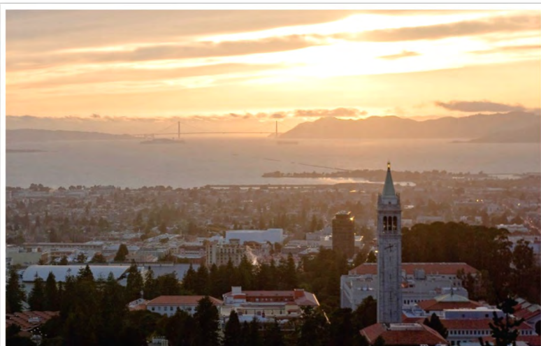
Looking out across the SF Bay to the Golden Gate Bridge from the Berkeley campus. The pointy building at the front of the image is the Berkeley Campanile (bell tower). I think its the third highest belltower in the world (sorry Richard Court!). The students here make a joke to unsuspecting tourists that in the event of a major earthquake it is designed to fall over and slide down the hill towards the bay, providing a convenient means of escape for anyone who can clamber onto it. I'm yet to see a tourist believe this story, but I always enjoy overhearing it.

No one in Australia had any idea where I was going when I went there!). In a PhD you mostly do scientific research, and it turns out that I'm pretty good at that and enjoy it a lot, so by the end of my studies I was getting a lot of encouragement to look for a job in a university. I hoped to move back to Australia and actually had taken a job at a university in Sydney when a position opened up at Berkeley - which is the best university in the US to do environmental engineering work. I never expected they'd hire